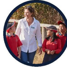
Build skills through fun