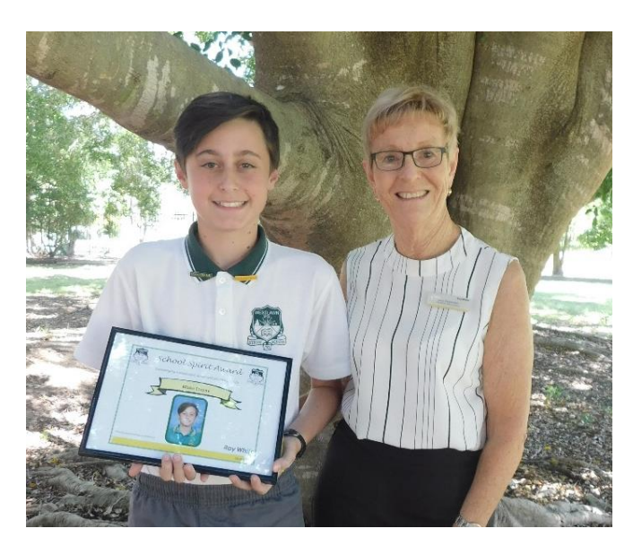
Major Award Recipients